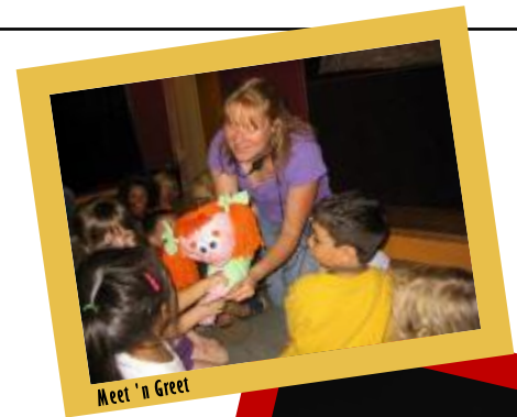
Meet 'n Greet