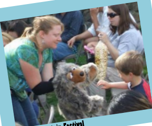
Sandy Mountain Festival