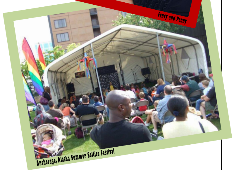
Anchorage, Alaska Summer Solstice Festival