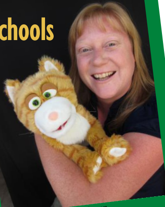
Murcin' But Trouble and Penny