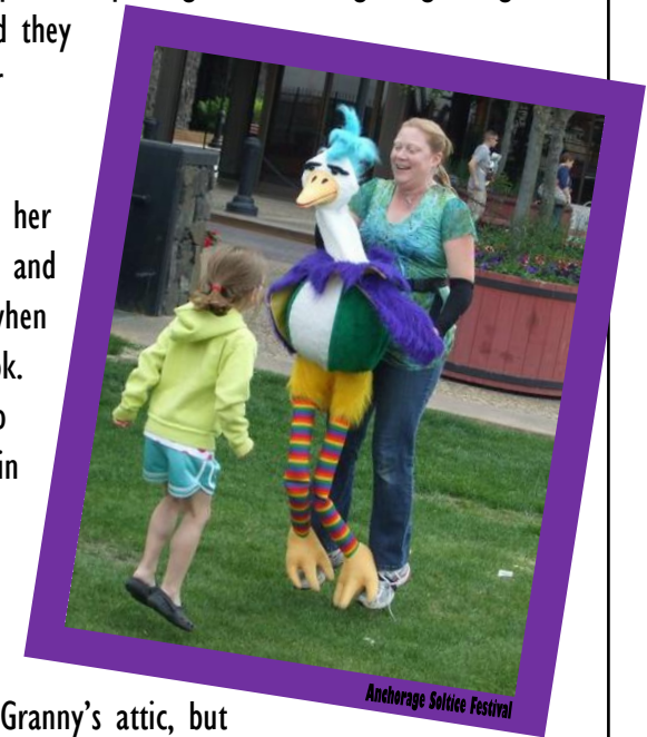
Anchorage Soltice Festival

The Magic Book Robin is visiting her grandmother for summer vacation and helping her clean out her attic, when she discovers a magic talking book. The magic book invites Robin into its pictures and stories. Soon Robin finds herself inside the book and all of its adventures, meeting dragons, whales, and a bee named Buzzy. After a full day of play, Robin wants to go back to Granny's attic, but how? It takes some creative ideas from Buzzy the Bee to get Robin back home. Join the colorful cast on this musical adventure! Big fun!