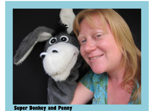
Super Donkey and Penny

Super Donkey Super Donkey is out to find the best in everyone. Join him as he has a fun-filled day of helping everyone find their own Super Powers, including you!